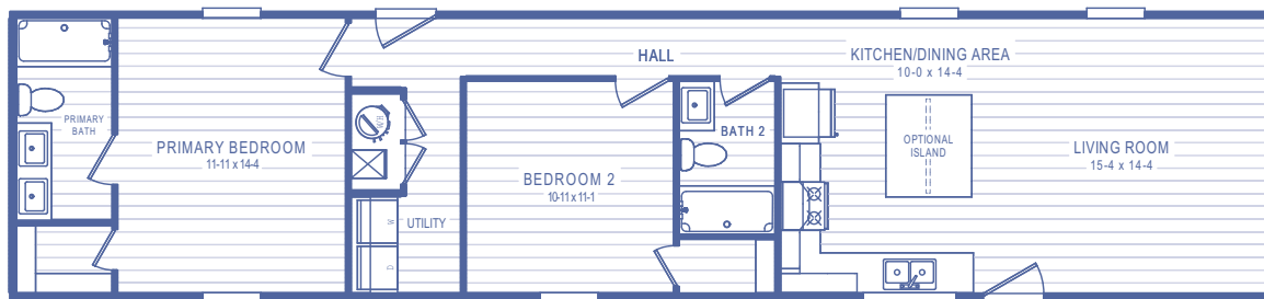
OPTIONAL 2 BEDROOM LAYOUT